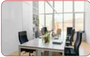
Gurugram State Office