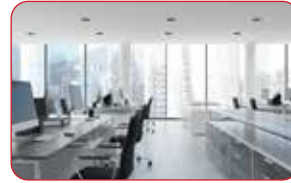
New Delhi Corporate Office